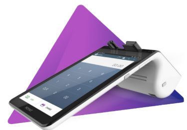
POYNT TERMINAL World's first smart terminal