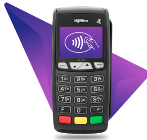
INGENICO ICT250 Colour desktop